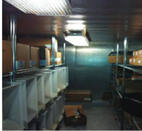
Figure 4 - After - Ice is cleared

After 30 days of data was pulled from the controller, the charts revealed more stable temperature, maintaining the desired setpoint, the system additionally was able to shut off for several hours in some cases – saving energy while still maintaining the desired temperature.