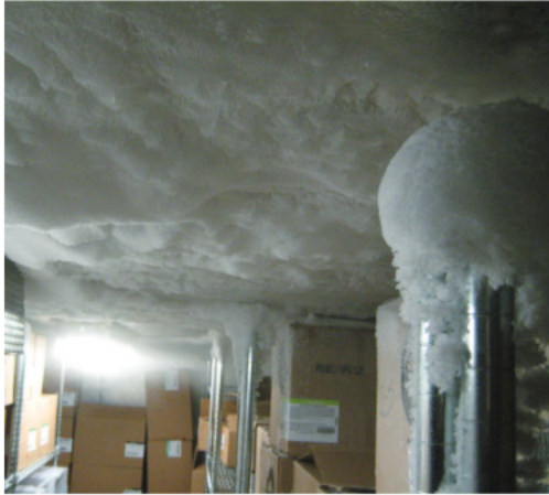
Figure 3 - Before - Severe ice problem

At the same time the KE2 Evap was able to eliminate the icing issues. The before and after photos, Figures 3 & 4, show the difference.